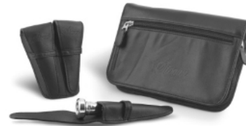
Leather mouthpiece pouches