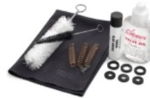
Trumpet care kit with brushes