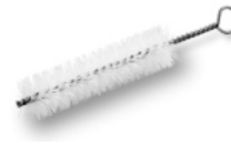
Valve casing cleaning brush