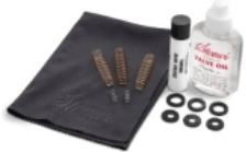
Trumpet care kit