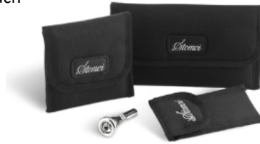
Nylon mouthpiece pouches